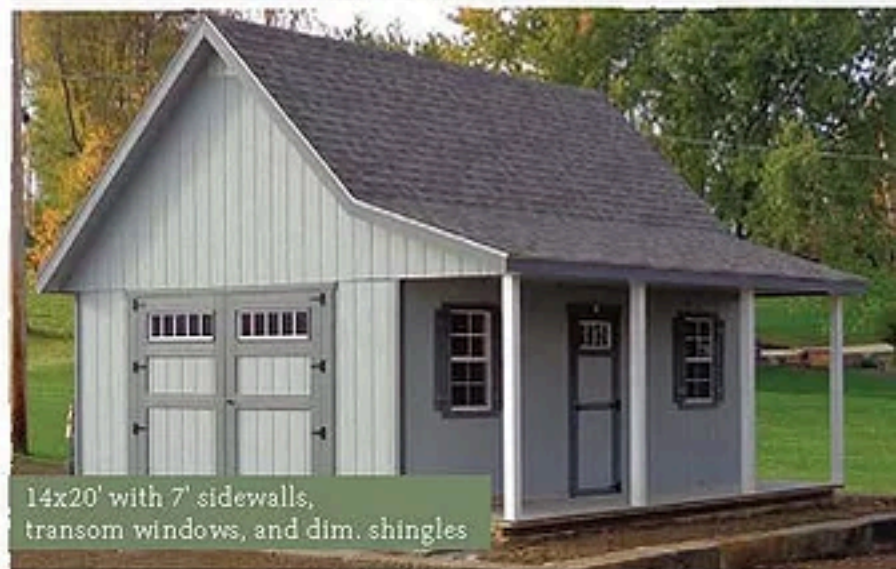
14x20' with 7' sidewalls, transom windows, and dim. shingles