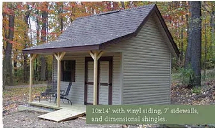
10x14' with vinyl siding, 7' sidewalls, and dimensional shingles.