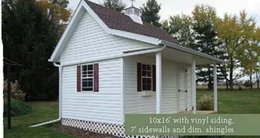
10x16' with vinyl siding, 7' sidewalls and dim. shingles