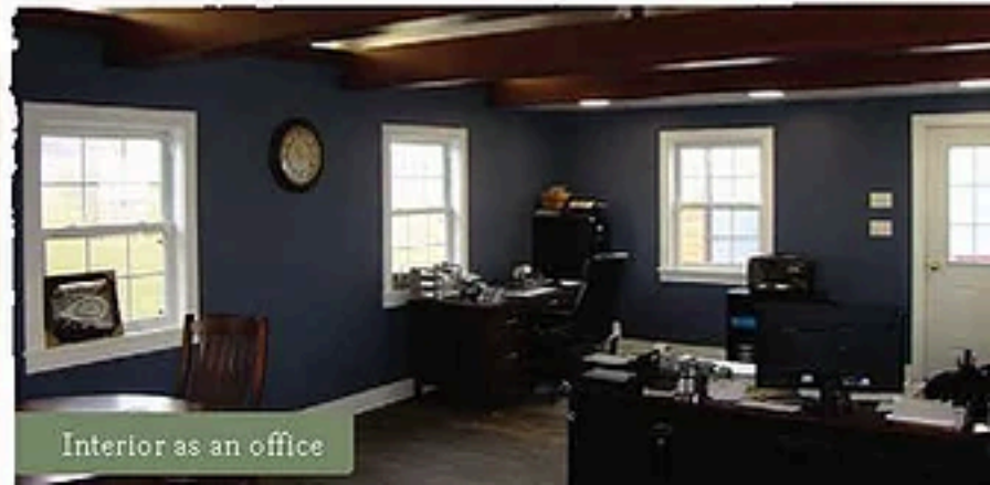
Interior as an office